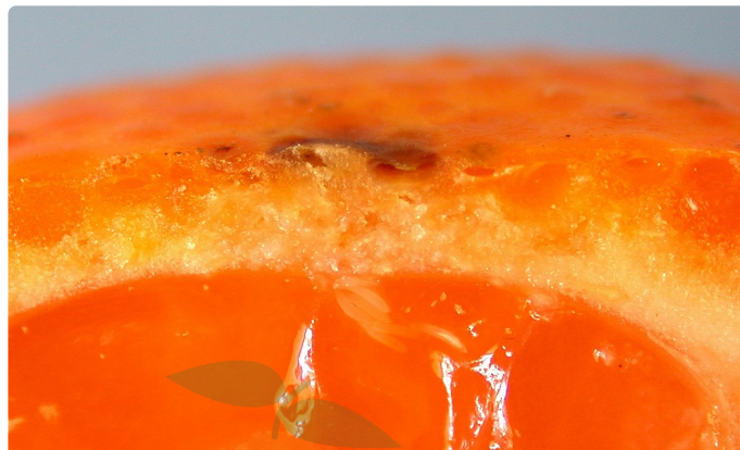
Fruit fly eggs