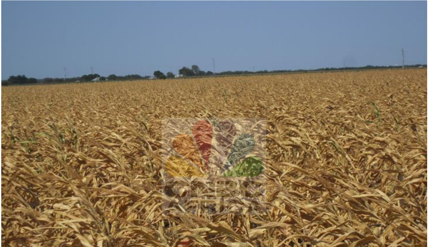
Scorched maize field.

S outh Africa remains in the grip of a drought that is not expected to ease soon, a government task team said on Thursday, putting pressure on inflation as the cost of staple foods soars.